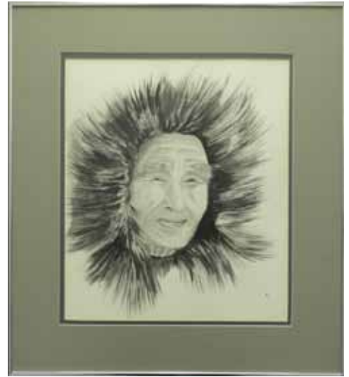
3038 "Untitled 2" Artist: Betty Atfoot Medium: Pen & Ink Drawings Donated By: Anonymous Value: $200 18.5"x20.25"