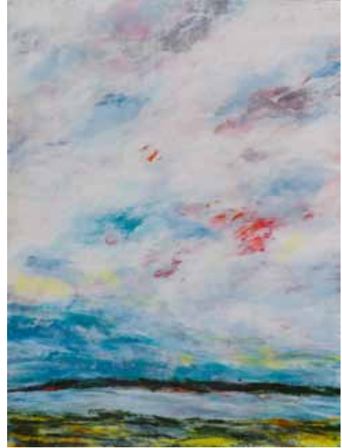
3012 "Laced with Red" Artist: Cheryl Lyon Medium: Encaustic on Wood Panel Donated By: Cheryl Lyon Fine Art Studio Value: $850 18"x24" www.cherylllyon.com