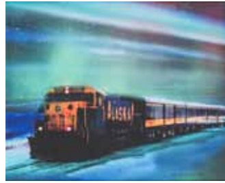
2001 "Aurora Train" Artist: Dianne Roberson Medium: Photo on Canvas Donated By: Artist Value: $600 20"x16" www.artworldplus.com