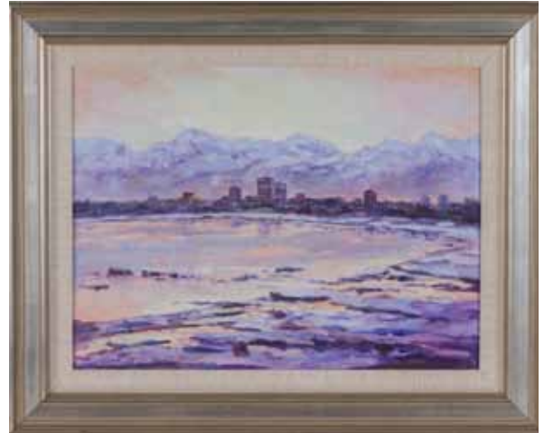
3028 "Good Morning Anchorage" Artist: Lynn Brautigam Boots Medium: Oil on Canvas Donated By: Artist Value: $1200 25"x31" http://lynnbootsart.com/