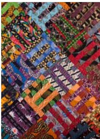
1023 "King Sized Quilt" Artist: Elise Rose Medium: 100% Cotton Donated By: Artist Value: $1000 91"x109"