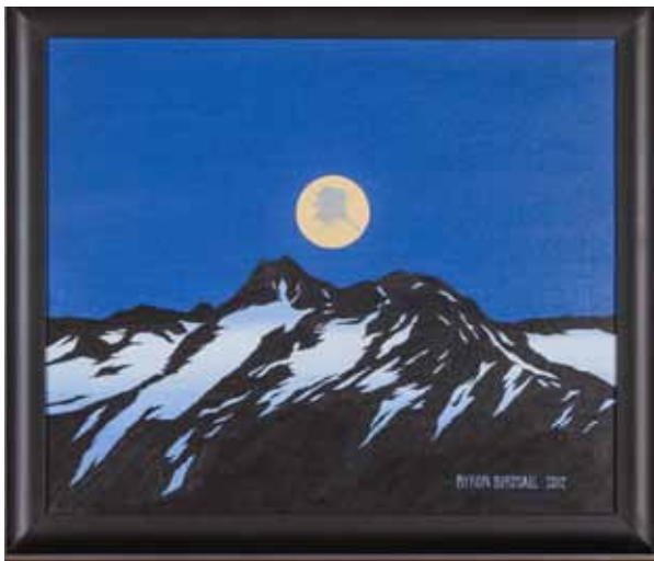
3022 "Map in the Moon" Artist: Byron Birdsall Medium: Oil Donated By: Artist Value: $2750 22"x28"