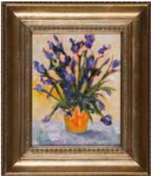
3009 "The Garden Iris" Artist: Peggy McFarland Medium: Oil on Canvas Donated By: Artist Value: $300 15"x13"