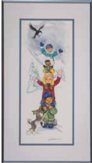
1029 "Totally Totem" Artist: Cindy Pendleton Medium: Watercolor Donated By: Pendleton Fine Arts Value: $425 21"x12" www.pendletonfinearts.com