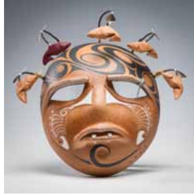
2019 "Red Salmon" Artist: David Groat Medium: Red Oak, Copper Wire, Duck Feathers & Ivory Donated By: Artist Value: $385 10"x10"x1.5" davidgroat.com