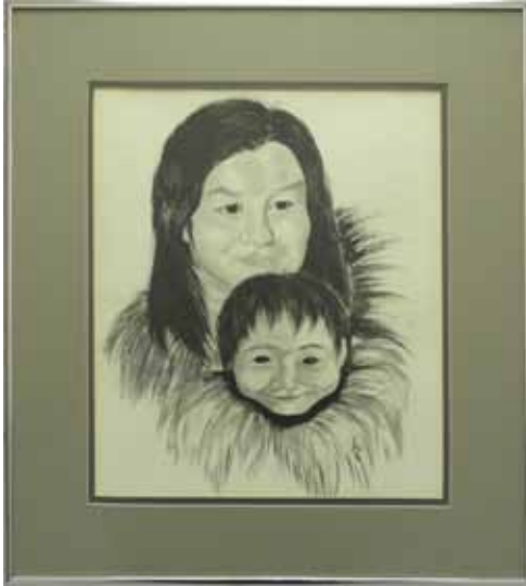
3036 "Untitled 1" Artist: Betty Atfoot Medium: Pen & Ink Drawings Donated By: Anonymous Value: $200 18.5"x20.25"