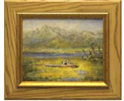
2037 "Joe Redding Boat" & "Palmer Hay Field" Artist: Sharen Harris Medium: Oil Donated By: Artist Value: $360 12"x14" and 4"4"x1"x www.sharenakharris.com