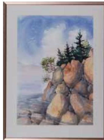
1019 "Turnagain Arm" Artist: Teresa Ascone Medium: Watercolor Donated By: Artist Value: $1100 22"x28" www.teresaascone.com