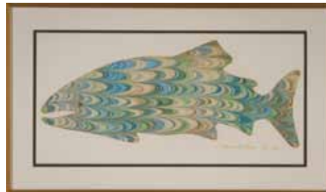
2005 "Blues Salmon" Artist: Sue Zajac Medium: Watercolor Marbling; Embellishment with Fluid Acrylic Donated By: Artist Value: $350 14"x24" suezajacoriginals.com