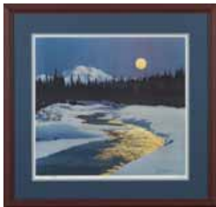
3010 "River of Gold" Artist: Byron Birdsall Medium: Offset Lithograph Numbered 605/705 Donated By: Anonymous Value: $325 27"x28.5"