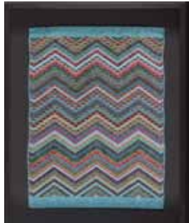
1002 "Untitled" Artist: Cynthia Castle Medium: Beadwork Donated By: Artist Value: $400 20"x16"