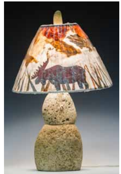
2015 "Alaska Stone Lamp" Artist: Stone Age Alaska Medium: Granite Donated By: Stone Age Alaska Value: $250 18" tall www.stoneagealaska.com