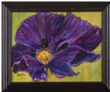
1011 "Purple Oriental Poppy" Artist: Pat Gillin Medium: Acrylic Donated By: Artist Value: $250 14"x16.5" www.gillin.us