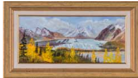
2014 "The Matanuska Glacier" Artist: James B. Leach III DVM Medium: Oil Donated By: Artist Value: $400 13"x23" www.traildoc.com