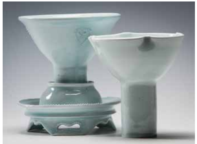
3024 "Wine Cup on Stand" Artist: Candy West Medium: Ceramic Porcelain; Wine Cup on Stand with Additional Cup Donated By: Artist Value: $1150 7"x5"