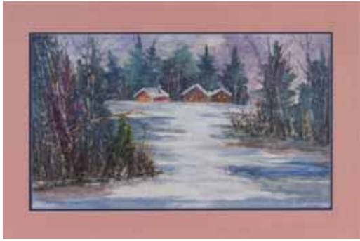
1015 "Quiet Morning" Artist: Olena Berggren Medium: Mixed Media on Arches Paper Donated By: Artist Value: $1100 26"x38" www.olenasarts.com