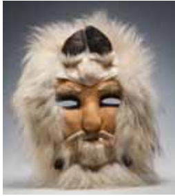
3030 "Native Mask" Artist: Lela Akkgook Medium: Natural Materials Donated By: Anonymous Value: $125 12"x9"