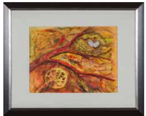
3013 "Dream Song" Artist: Yuliya Kelgesehen-Thompson Medium: Acrylic Donated By: Artist Value: $500 26"x31" www.yuliyat.com