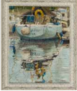
2009 "Reflections of Homer" Artist: Jeanne Young Medium: Oil Donated By: Artist Value: $1250 20"x16" www.jeanneyoung.com