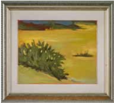
2022 "Discovery Point" Artist: M. Thompson Medium: Oil Donated By: Anonymous Value: $150 9.5"x11.5"