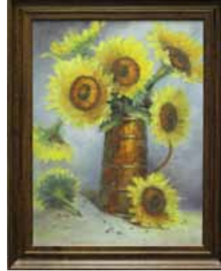
1032 "Sun Flowers" Artist: Sharen Harris Medium: Oil Donated By: Artist Value: $700 19"x15" www.sharenakharris.com