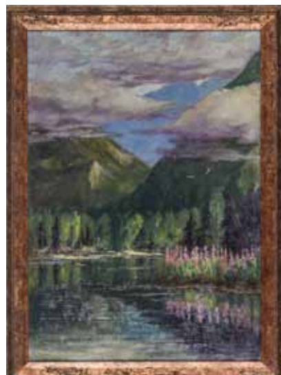
2007 "After the Rain" Artist: Don Kolstad Medium: Oil on Gessoed Board Donated By: Artist Value: $2000 25"x18" http://donkolstadart.com/