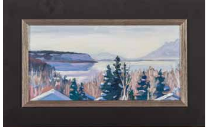
1018 "Pt. Woronzof #2" Artist: Susan Swiderski Medium: Plein Air Oil Donated By: Artist Value: $250 9.5"x15.5" www.susanswiderski.com