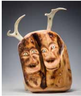
1024 "Ircennrag" Artist: Moses Tulim Medium: Wood Donated By: Mo's Arts Value: $175 15"x12"x6"