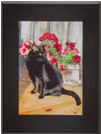
3004 "Your Cat in Watercolor" Artist: John Beebee Medium: Watercolor Donated By: Artist Value: $350 27"x20.5"