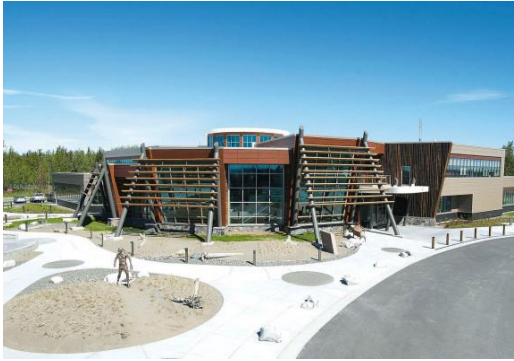
The Dena'ina Wellness Center