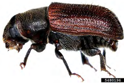
M. O'Donnell and A. Cline, Wood Boring Beetle Families, USDA APHIS ITP, Bugwood.org

The tree was attacked last season or before and exhibits evidence of prior beetle attack and emergence holes. Beetle larvae may not be present although there may be some adults. Large portions of the bark may be removed by woodpecker activity. These trees can serve as host sites for future infestation when the beetles emerge in mid-May to early June. Remove a section of the bark to determine if the beetles are present. If